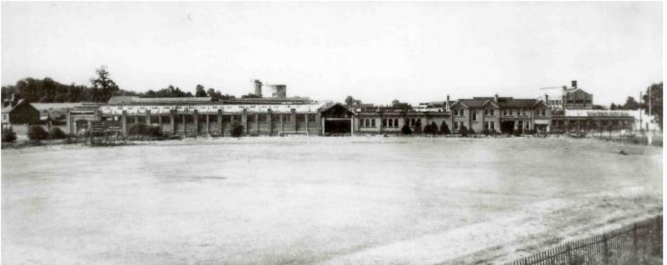
Sketchley Dye Works 1950's, now a housing estate